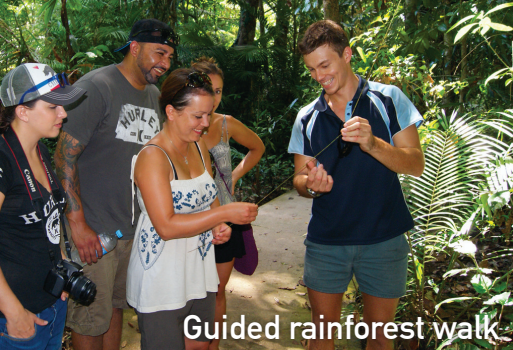
Guided rainforest walk