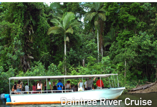
Daintree River Cruise