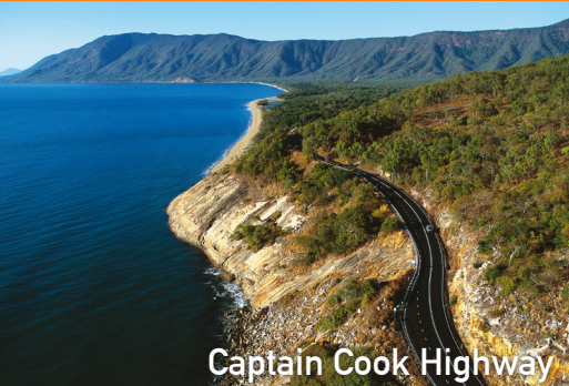
Captain Cook Highway