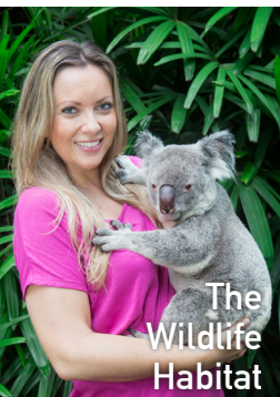
The Wildlife Habitat