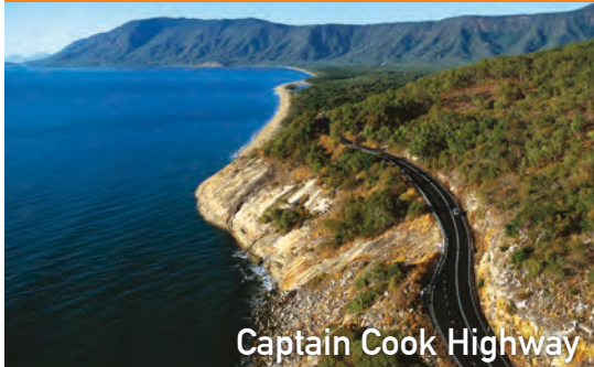
Captain Cook Highway