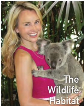
The Wildlife Habitat