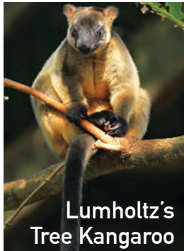
Lumholtz's Tree Kangaroo