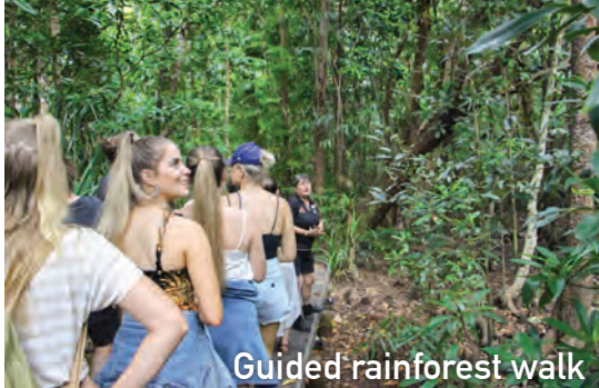
Guided rainforest walk