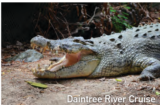
Daintree River Cruise