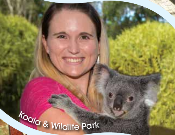
Koala & Wildlife Park