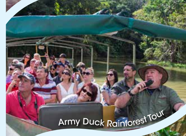
Army Duck Rainforest Tour