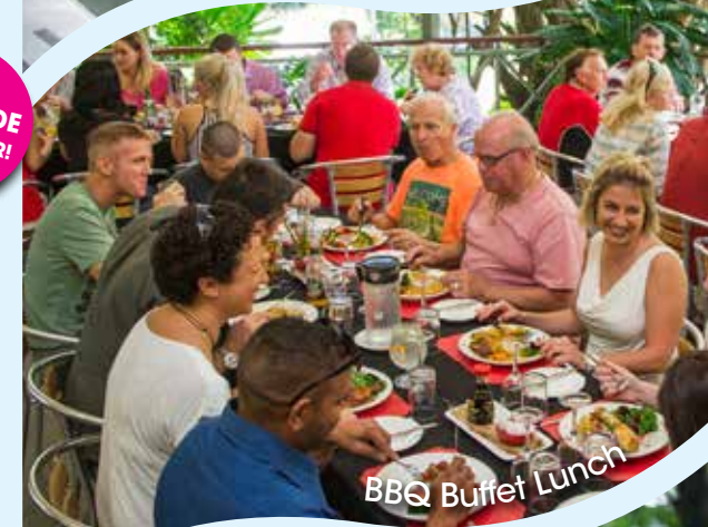
BBQ Buffet Lunch