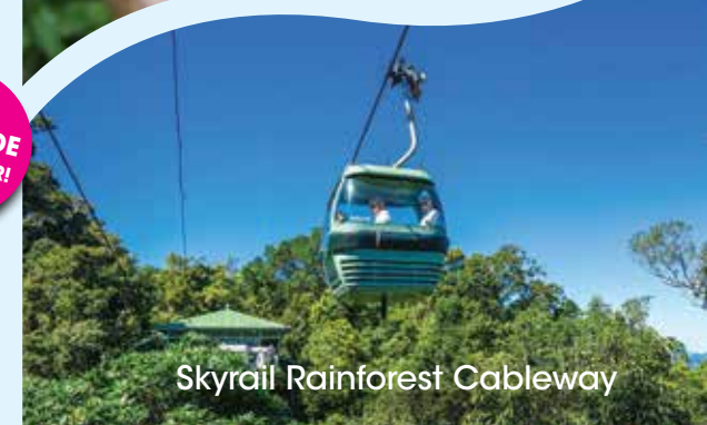
Skyrail Rainforest Cableway