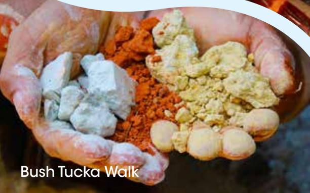
Bush Tucka Walk