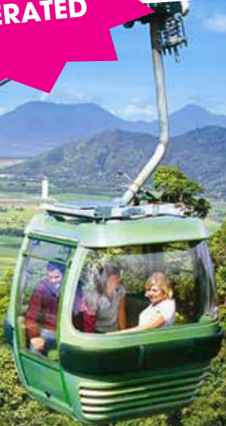
Skyrail Rainforest Cableway