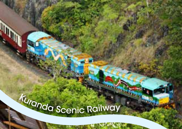
Kuranda Scenic Railway