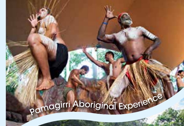
Pamagirri Aboriginal Experience