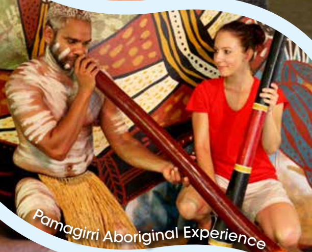
Pamagirri Aboriginal Experience